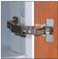
EASY ACCESS HINGES Hinges open through a wide 164° for ease of access.